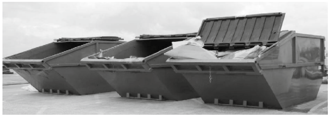
Figure 3. Containers used for selective waste collection

ment protection criteria(Rosik-Dulewska, 2010). Storage has to be carried out in a selective way, however in certain cases there is a possibility of storing waste in a non-selective manner, which is regulated by the legal act (Ordinance of the Minister of Economy on types of waste not subject to selective storage in landfills). Environment protection regulations determine requirements that are to be met in connection with waste storage. The process should be carried out in accordance with environment protection and human health protection rules, in particular in a way that accounts for physical and chemical properties of waste (i.e. physical state, qualities that make waste hazardous and possible treats it may cause). Proper storage has to protect environment from penetration of contamination to water and soil (liquid waste is particularly dangerous).